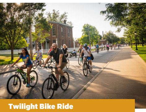
Twilight Bike Ride