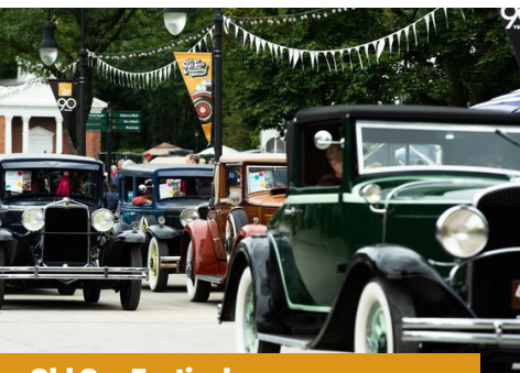
Old Car Festival