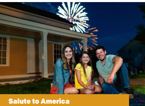
Salute to America

Discounted tickets available for purchase.