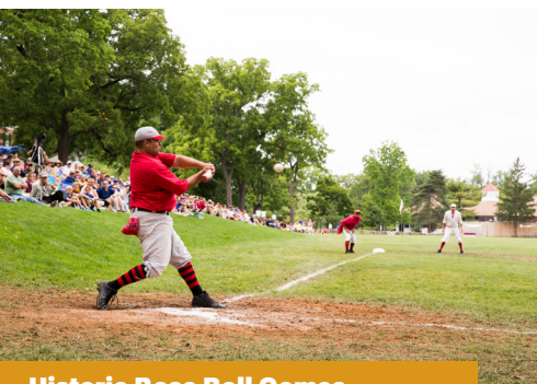
Historic Base Ball Games

Free with digital corporate membership pass or included with village admission.