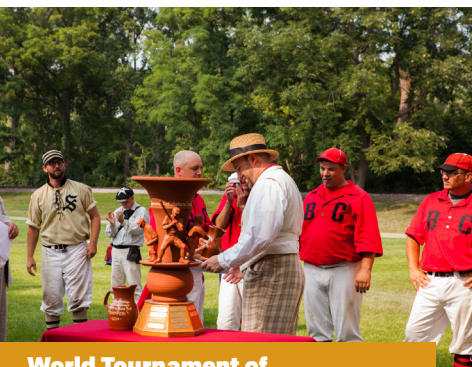
World Tournament of Historic Baseball

LEARN MORE ABOUT FEATURED PROGRAMS AND EXHIBITS IN 2025 AT THF.ORG.