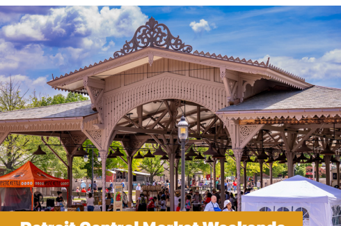
Detroit Central Market Weekends

Free with digital corporate membership pass or included with village admission.